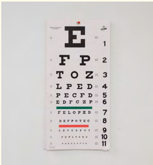
An example of a chart used in a visual acuity test (Snellen chart)

The optometrist or their assistant will ask you to read letters from a chart, card or screen.