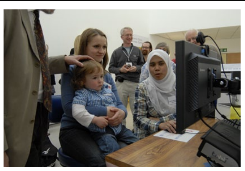
A toddler putting the Tobii Systen through its paces.

As is often the case, the development of technology like this comes from another world altogether: market researchers use eye-tracking devices as a tool to work out where people focus their attention in adverts, on web pages, when viewing television and so on. But it is also an invaluable tool for tracing